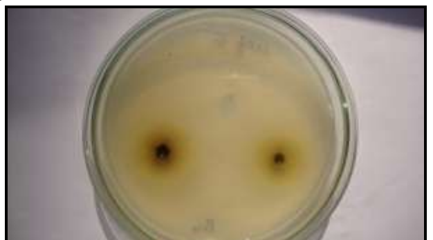
Plate 1. Antimicrobial activity of ethanol extract of leaf of Trigonella foenum-graecum l. against

Ethanolic extract of leaf and shoot tip have shown antibacterial activity against Salmonella typhi at a concentration of 50mg/ml (Fig 1).