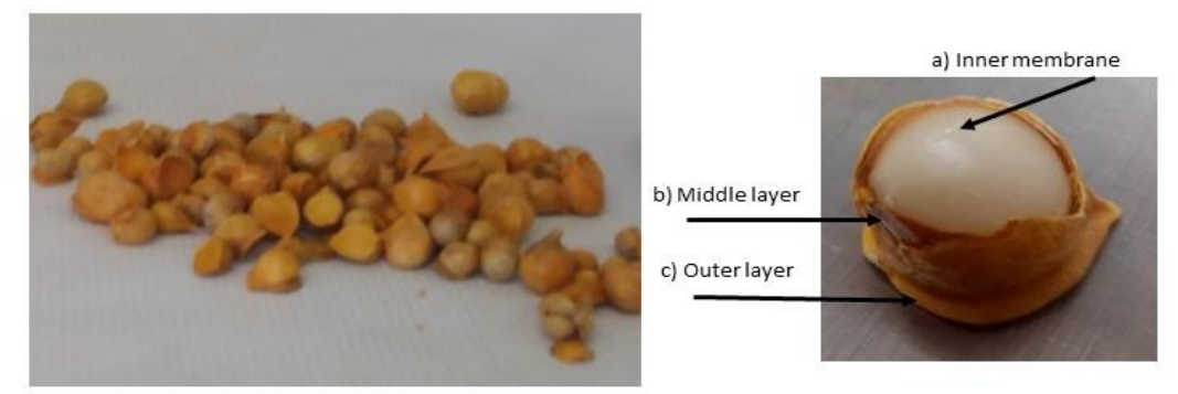
Figure 1. Snow Mountain Garlic.On the left, the rounded shapes of the bulbs are observed with a flattened face that ends at a peak, while bulbs of different sizes are found; on the right, garlic protections are shown: (a) the inner membrane is a thin transparent layer that allows to see the whitish slice (b) the middle layer consists of a semi-rigid brownish brown structure that is attached to the inner membrane, (c) the outer layer of solid consistency that varies from yellow to dark brown depending on the maturation of the bulb.