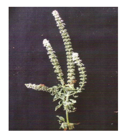
Fig. 2 Geniosporum prostratum floral part